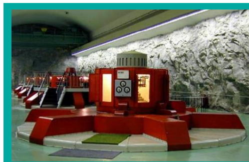
Hydro power station in Kristiansand.

They came into the market looking for more data center space to house their high performance computing (HPC) research cluster but with a keen desire to focus on sustainability and also drive a lower total cost than traditional colocation.