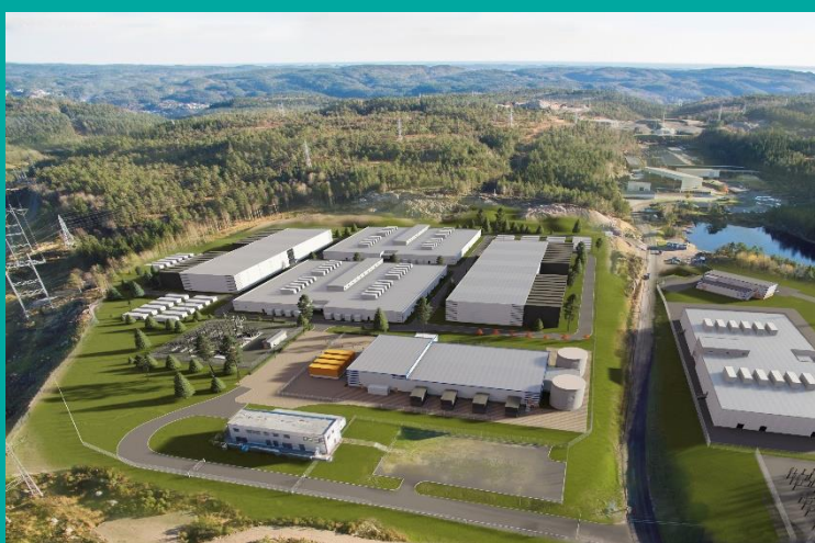
3D illustration of our N01 Campus in Kristiansand.

Now with the data center live in Bulk’s N01 campus the company is benefitting from a highly resilient solution which is 100 percent carbon free. And with cost savings of up to 60 percent on power alone when compared to an equivalent installation in London it really hits home the potential TCO benefits of being with Bulk in Norway.