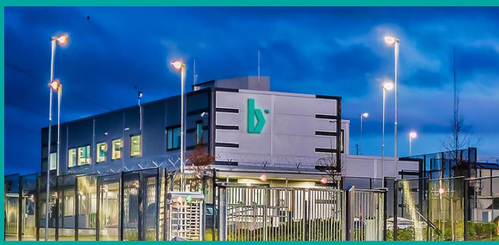
Entrance and building at N01 Campus.

The installation and logistics of the company’s equipment would be valued at around £20-25 million. Bulk were able to act as an importer of record and take care of the correct reporting of VAT to ensure that goods could be imported without any cost or negative liquidity effects for the company. This related to import VAT of around £6m.